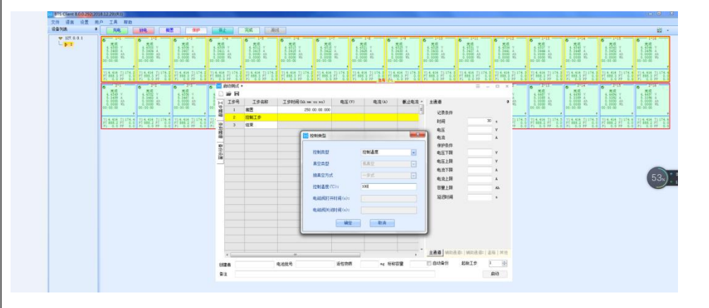
Step 5: Set the working step control conditions